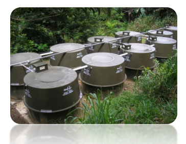
Waste Treatment System